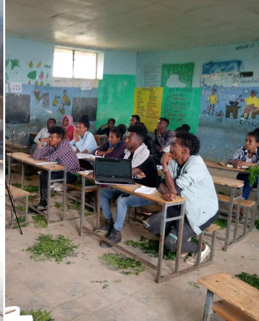
Sassakawa in Ethiopia training and teaching in the Southern regions .